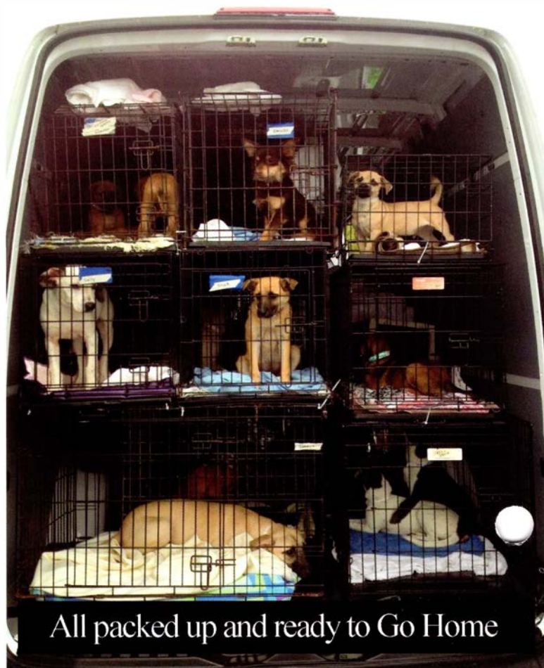
All packed up and ready to Go Home

In 2012 our Humane Society teamed up with the “Go North” collaborative; a program that transports dogs from eight area shelters to high volume adoption shelters in Michigan, Minnesota, Illinois, Wisconsin, Ohio, and Connecticut. Since then over 874 unwanted animals from Union County have found new homes through this program alone! People up North have been known to stand in line waiting for the truck to arrive to get the quality animals we send them.