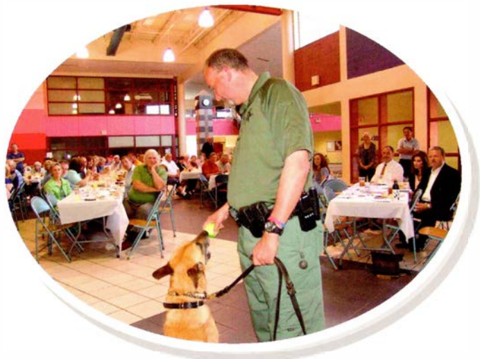
We were “putting on the dog” at the 2014 Annual Benefit Dinner

Non-profit Permit No. 625 Maynardville TN 37807