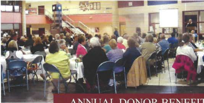
ANNUAL DONOR BENEFIT DINNER A SUCCESS!

Non-profit Permit No. 625 Maynardville TN 37807