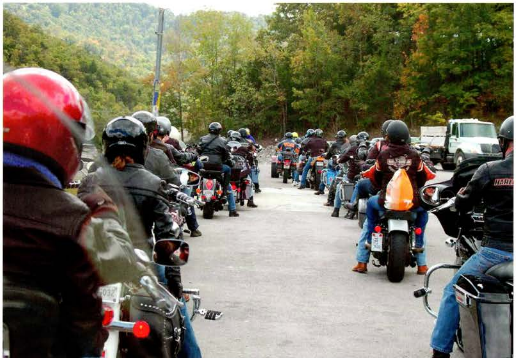
Riders off on a 100 mile ride through beautiful Eastern Tennessee.